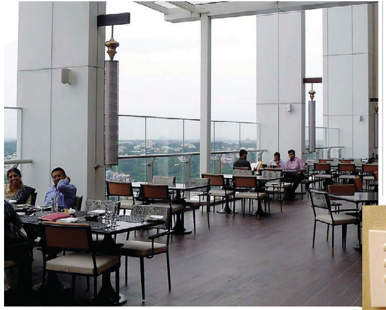
QSC AD-S52T wallmount speakers at the ouside restaurant terrace

'Once QSC proposed a digital solution the costing actually went down'