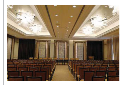
Three function rooms can be combined into a single space as required

In the first few months of opening, the hotel had already hosted many weddings. conferences and corporate events. 'On some days, five or six of the meeting rooms are